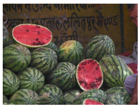
Bees enjoy the feast in India!

Air France has a fare to Edinburgh for about $7060 return including tax via Asia and Paris.