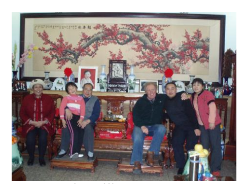
Homestay in Beijing.

This self-guided walking holiday features the magical city of Dubrovnik, a transfer to the Montenegrin town of Kotor, and its astonishing fjord, where you spend three nights and do a variety of walks, before returning to Dubrovnik for two nights.