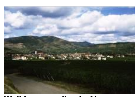
Walking or cycling in Alsace

This walk can be also called "the Balcony of the medieval Alsace", a balcony on which we are the spectators of the landscapes and its beautiful views. There is plenty of time to taste some world famous Riesling in between visiting 12th century buildings.