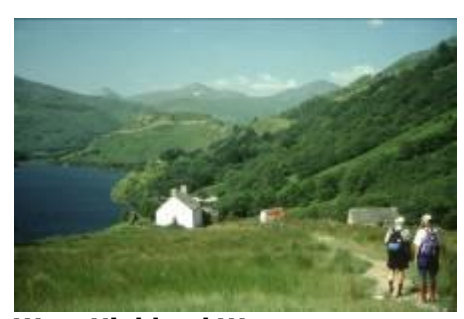
West Highland Way

Price is US$3290 per person and US$3000 for non-riders. This is based upon a group of 7 to 10 people. Airfares to and from Kathmandu are not included and would be about $1500 including tax.