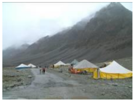
Cycling from Leh to Manali

I have a number of excellent photos which you can buy from me if you need to illustrate anything. Most are travel related and I have a few with some humorous signs or situations (see below).