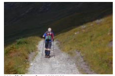
Walking the WHW

Travel to Peru on this family adventure and uncover the terraced ruins of Peru's mystical ancient city. Explore some of South America's most beautiful architecture in Lima before flying to Cuzco, journeying on to the cultural highlights of the Sacred Valley. Acclimatise in Chinchero and enjoy a local homestay, then warm up for the Inca Trail trek with a mountain bike adventure in the Andean countryside. Rest up and recharge in the ancient Ollantaytambo town of before embarking on the iconic Inca Trail to the ruined Inca city of Machu Picchu. This 14-day tour encapsulates Peruvian culture and lets you in on the secrets of their ancient civilisation.