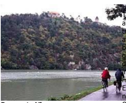
Passau to Vienna

Ostuni, the seaside village of Otranto facing the Adriatic and visit the elegant Baroque city of Lecce.