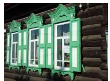
House on Lake Baikal

This newsletter is four pages long so sit down, pour yourself a wee dram and start planning.