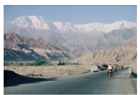
Cycling on the KKH in China

Widely recognised as one of the most beautiful places in the world, Cape Town and its surrounding countryside and beaches provide a stunning backdrop for this tour. Our unique circular route allows us to take in many of the fantastic sights that the Cape Peninsula has to offer. In addition to Table Mountain and the chance to sample the produce of the world famous wine estates of Stellenbosch, the wild coastline and rugged interior provide some classic riding on peaceful roads with very little traffic.