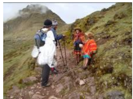
On the Lares Trek in Peru

The quality of overnight mountain huts is exceptional as is the nightly cuisine, ensuring you experience traditional Swiss alpine hospitality at its best.