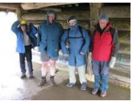
Ready for a bush walk in Victoria!

Nestling in the very heart of Glencoe, amongst the spectacular and majestic mountains of the Scottish Highlands, Clachaig Inn has been a source of accommodation and hospitality for travellers for over three hundred years. The hotel has 23 fully modernised bedrooms with en suite facilities with many enjoying magnificent views of the Glencoe mountains