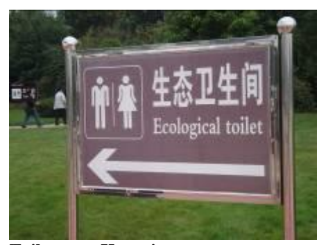
Toilet near Kunming

From the prestigious Loire River and its Royal châteaux, hiking via the green Sologne forest, to the famous Touraine Vineyards. You will enjoy the richness of the Loire Valley area: a rich artistic and historical heritage combined to incomparable flavours!